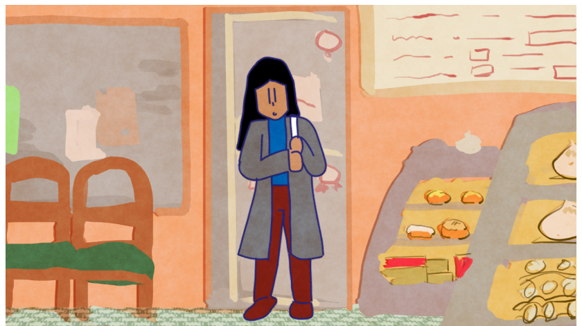
Scene from Macaroni Soup . Used with permission.

It's been pretty fun honestly! Well, it's kinda like applying to a job every single time in that you have to write a short cover letter. The only thing is that in most places when you apply to festivals you have to pay them. So I'm grateful that I have some money saved up, and I live at home, that I can actually do this stuff. It's been pretty fun. I can get connected to more of my city